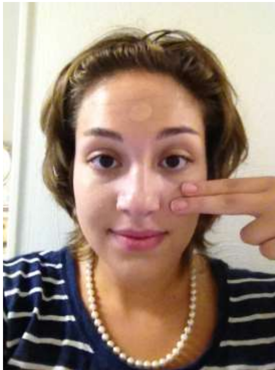
Above: Applying foundation.