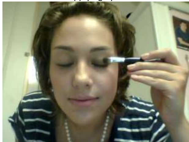
Below: Applying eye shadow.