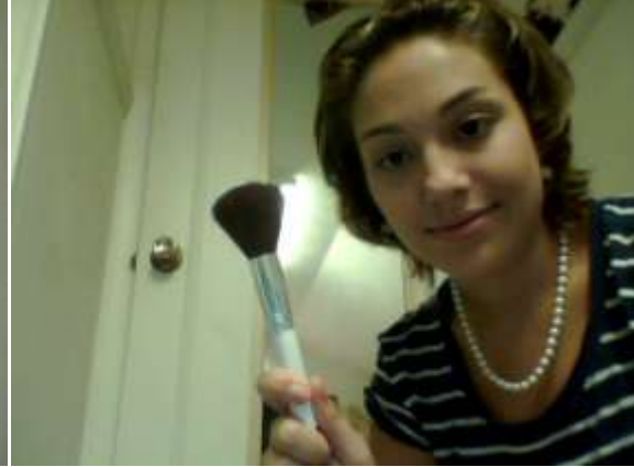
Right: A good example of a powder brush.