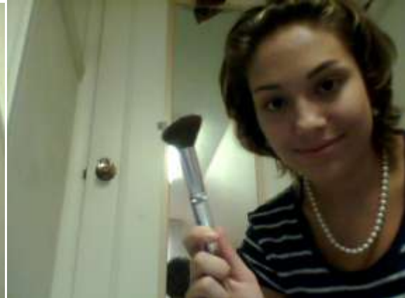
Right: A good example of an angled blush brush.