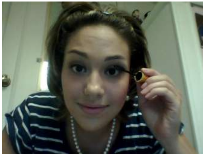
Above: Applying mascara.