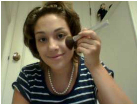
Left: Applying blush.