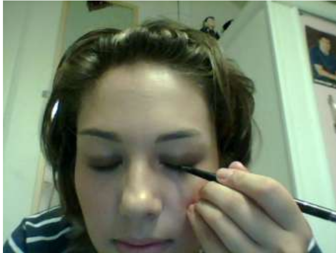
Above: Applying eye liner.