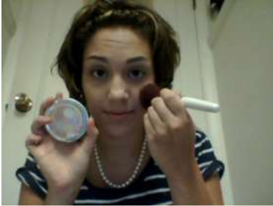
Left: Applying powder.