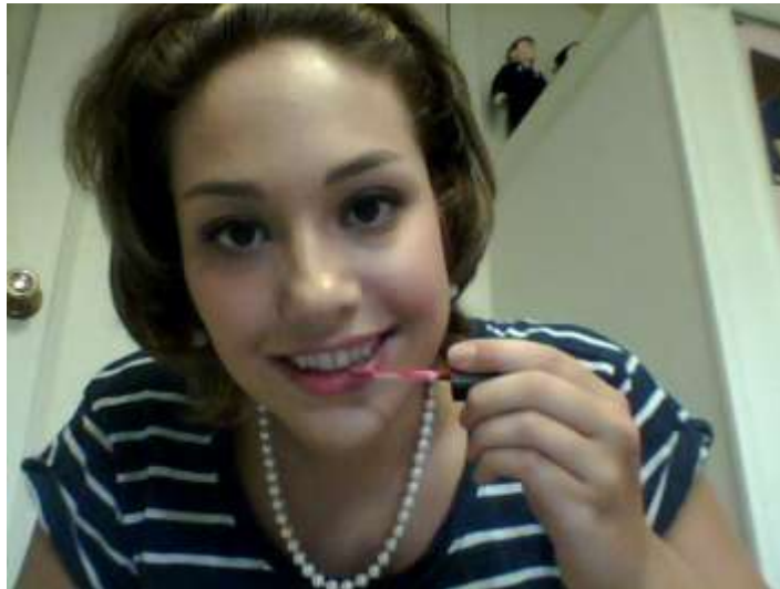
Above: Applying lip gloss.